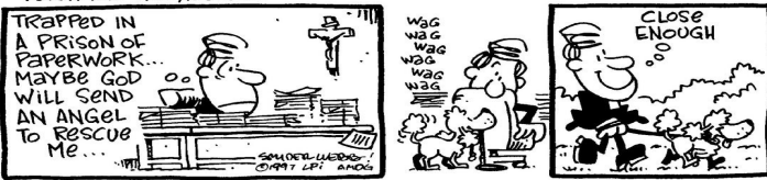
PETER AND PAUL, APOSTLES

"Teacher, do you not care that we are perishing?" He woke up, rebuked the wind, and said to the sea, "Quiet! Be still!" The wind ceased and there was great calm. They were filled with great awe and said to one another, "Who then is this whom even wind and sea obey?" — Mk 4:38c-39, 41